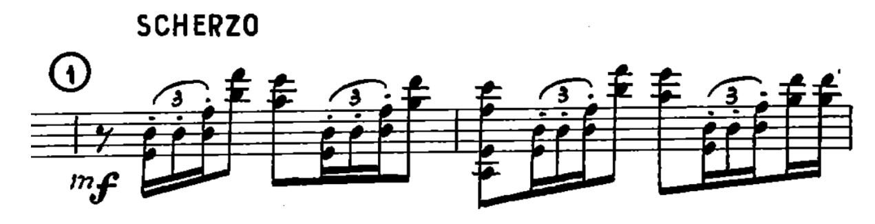
Example 3: Berimbau motive