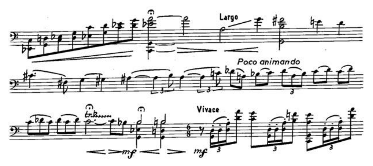
Example 4: Excerpt near end of Cadenza showing quotations of 2nd mvt. (Largo) and 3rd mvt. (Vivace).